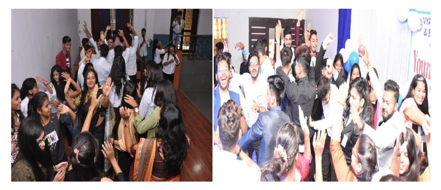
Talents of VCCBA performing at ALOHA